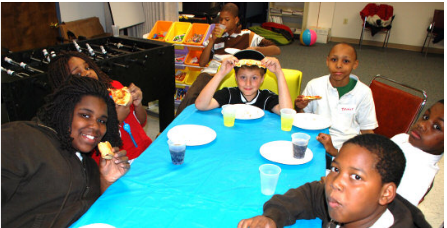
In new space at The Center, which includes areas for games and crafts, children from the Middle School peer support group enjoy a pizza party after their session.