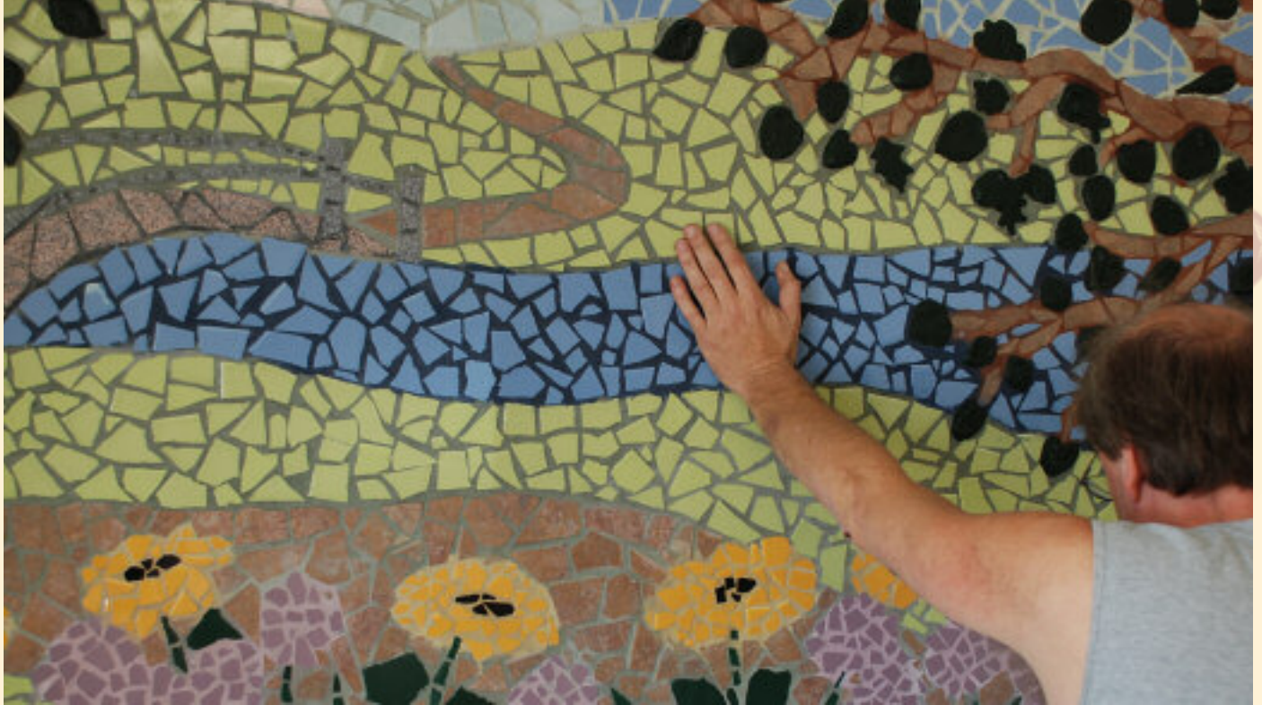
The Center's new home includes artwork donated by the Healing Art Project of COSACOSA art at large and created by members of the Society for the Arts in Healthcare. Members worked on the mural during their annual conference in Philadelphia earlier this year.